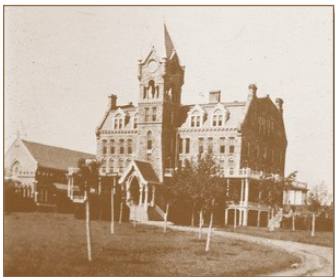
St. Mary's College in 1889