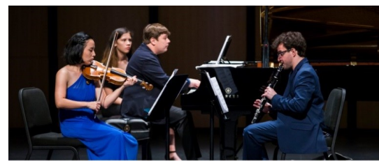
THE MAKE TRIO

As a center for the arts in Old East Dallas, St. Matthew's Cathedral Arts revives an ancient tradition of cathedral churches in proclaiming the presence of God through the beauty of human creativity, bringing vitality to St. Matthew's Cathedral, our neighborhood and greater Dallas.