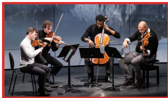
SMU Chamber Music