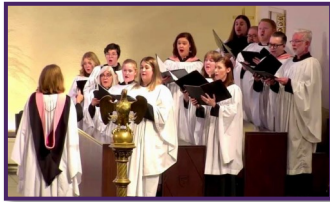
Cathedral Arts Choral Artists