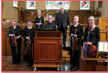
Texas Camerata in the Cathedral