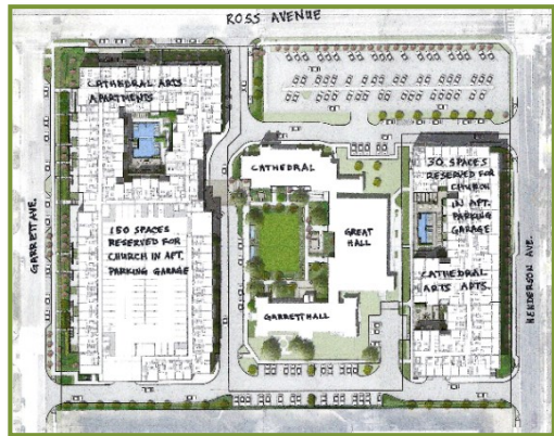
Alexan Cathedral Arts Apartments at the St. Matthew's Campus