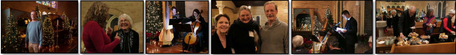
A TRIO OF CRÊCHES—JANUARY 6