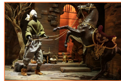
Detail from the Three Crèches Installation Created by Tommy Bourgeois.