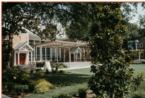
Cathedral Close and Great Hall Entrance.