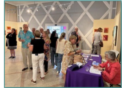
Opening Reception for April's Three Points of View Exhibit

Wishing you happy holidays and a joyous New Year. We're looking forward to many exciting announcements for you in 2026. Please join the emailing list! Send your request to info@cathedralartsdallas.org .