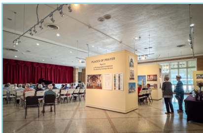
Great Hall Performance Space, Sundermann Gallery and Reception Area